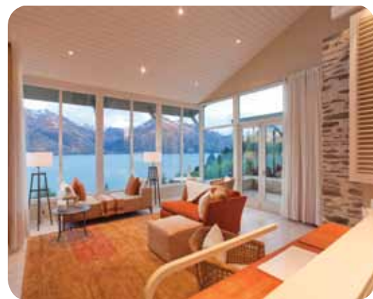
▲ PHOTO: THE LOUNGE AT MATAKAURI LODGE ENABLES GUESTS TO TAKE IN THE REMARKABLE VIEWS