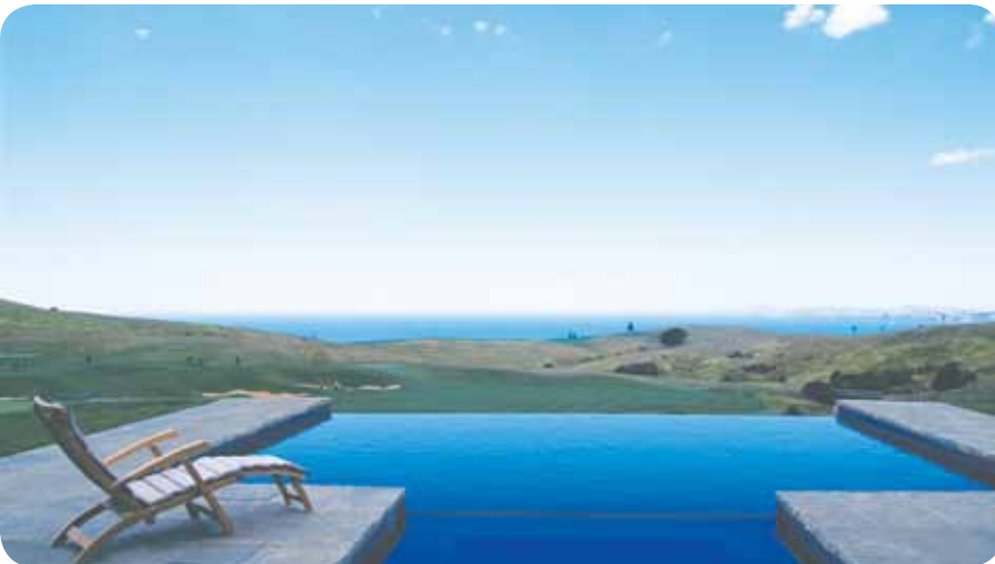
▲ PHOTO: RELAX IN SERENITY BY KAURI CLIFF'S INFINITY POOL.

Home to 150 lush islands and crystal-clear waters, the Bay of Islands is an aquatic paradise. Located in the Northland region, the area offers myriad outdoor pursuits and a rich history. Sailboats and luxury yachts take visitors to private beaches for swimming, snorkeling and sea kayaking, while fishing enthusiasts try their hand at catching yellow fin tuna, marlin or kahawai; scuba divers discover beautiful reefs, captivating marine life and sunken vessels prime for deep-sea exploration. Activities on land and in the air include quad biking in the dunes at Ninety Mile Beach, scenic helicopter flights, visits to Rainbow Falls, Doubtless Bay and the Puketi Kauri Forest, and traditional New Zealand pig hunts. Local history is shared at early Maori and European settlements, the Waitangi Treaty Ground and Russell, the country's first capital.