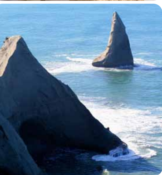
▲ PHOTO: THE FIVE-STAR FARM AT CAPE KIDNAPPERS OFFERS SPECTACULAR VIEWS OF THE PACIFIC OCEAN