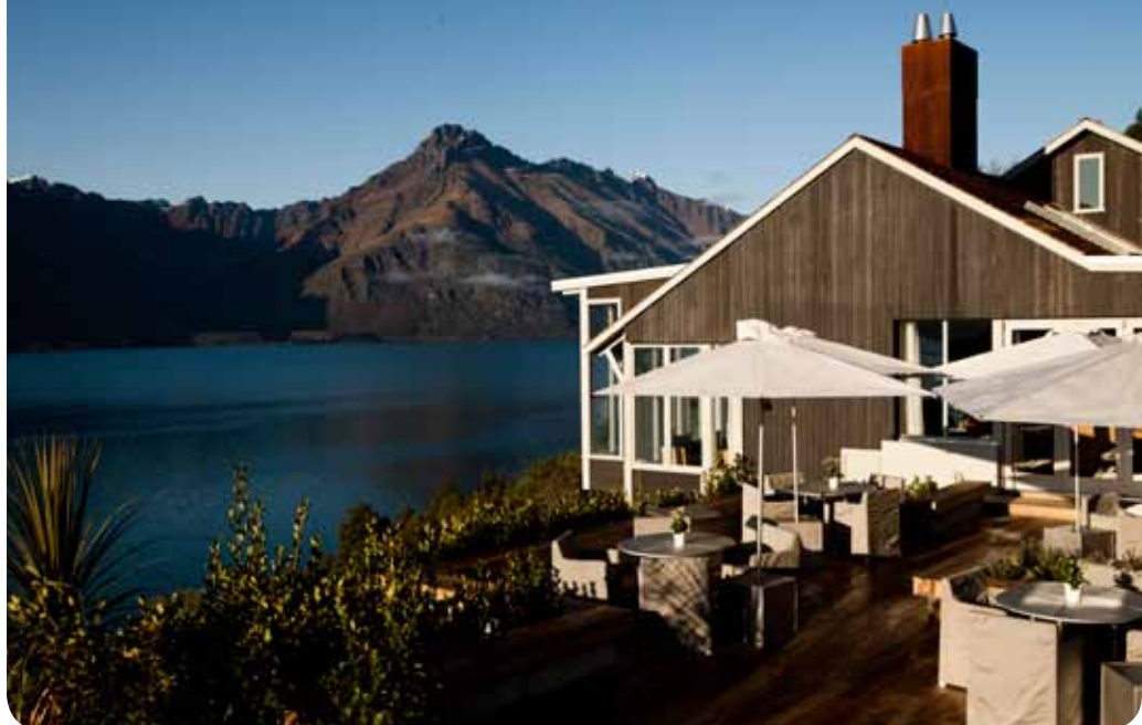
▲ PHOTO: MATAKAURI LODGE SITS ON THE EDGE OF LAKE WAKATIPU.

the skies for a hot-air balloon ride over the area's bucolic landscape.