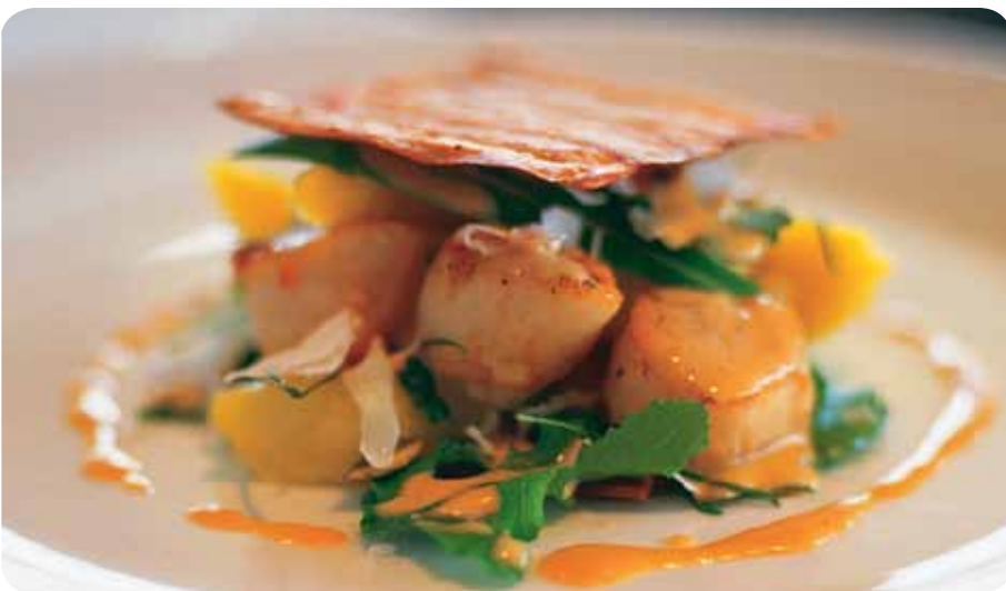
▲ PHOTO: A SPECTACULAR MEAL AT THE LODGE AT KAURI CLIFFS OFFERED UP THIS SCRUPTIOSUS SCALLOP DISH.